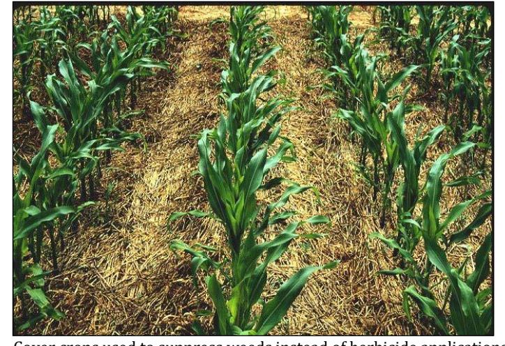
Cover crops used to suppress weeds instead of herbicide applications.