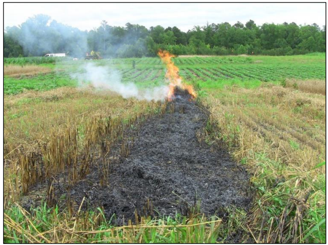
Burning weeds instead of herbicide applications.