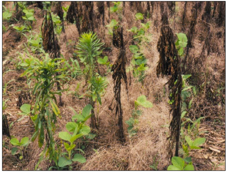
Herbicide-resistant weeds survive herbicide application in soybeans.