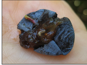
SWD larvae developing inside blueberry fruit.