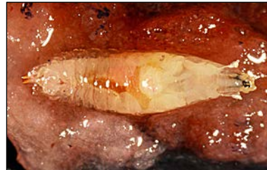
Closeup of SWD larvae in strawberry fruit