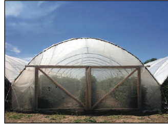
Exclusion netting supplements this high tunnel where raspberries are being grown.