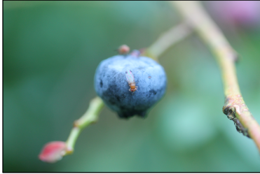
SWD on Blueberry.