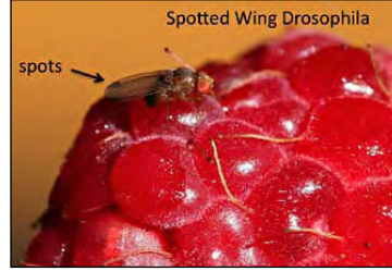
Adult SWD on raspberry.