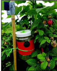
A trap for monitoring SWD.