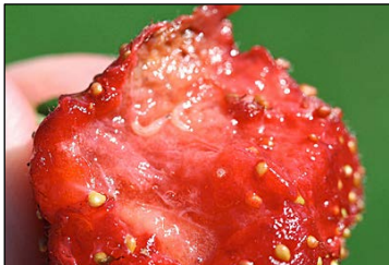
Larvae of SWD in strawberry fruit.