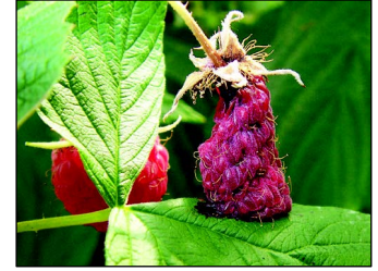
SWD larvae feed on the raspberry.