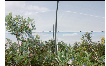
Inside the exclusion netting over a blueberry planting. SWD infestation can be managed without insecticide sprays, provided no SWD get inside. Therefore, monitor for SWD inside the exclusion net with traps and fruit sampling.