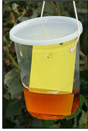
Monitoring trap for adult SWD flies.