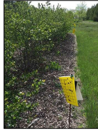
Commercial yellow sticky trap baited with insect pheromone for SWD fly monitoring.