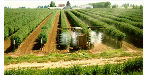
SWD requires frequent pesticide applications.