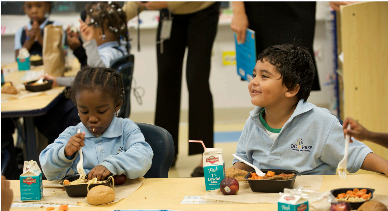
Meals taken in classrooms expand cafeteria and kitchen pest problems throughout the building.