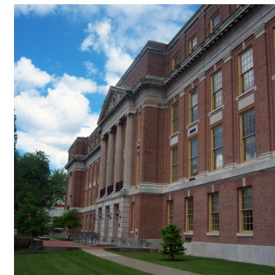
Older buildings in both rural and urban areas often have inherent structural pest problems.