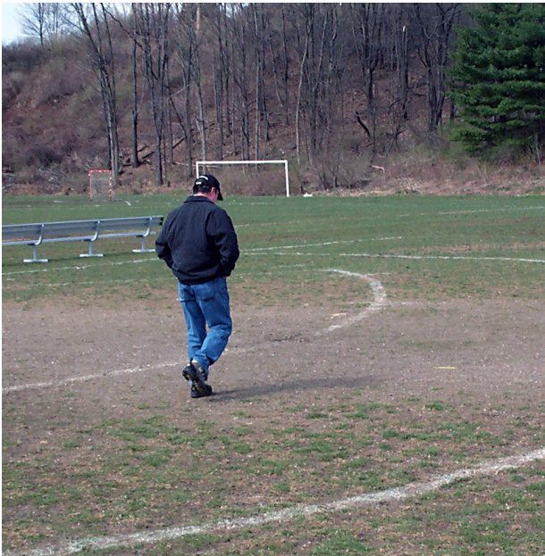
Overuse of athletic fields is not only unsightly but increases the risk of injury.