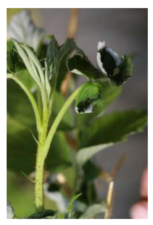
Thermal injury Early May