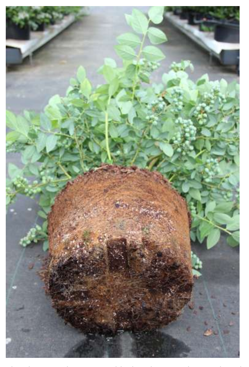
Aurora plant, planted in January 2011 from a 1,5 liter pot to this 20 liter pot. The plant was then 1 year old. This photo is taken on the July 12<sup>th</sup>.