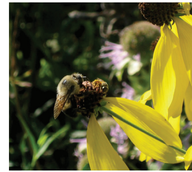
Two bees share a flower of Ratibida pinnata, yellow coneflower.