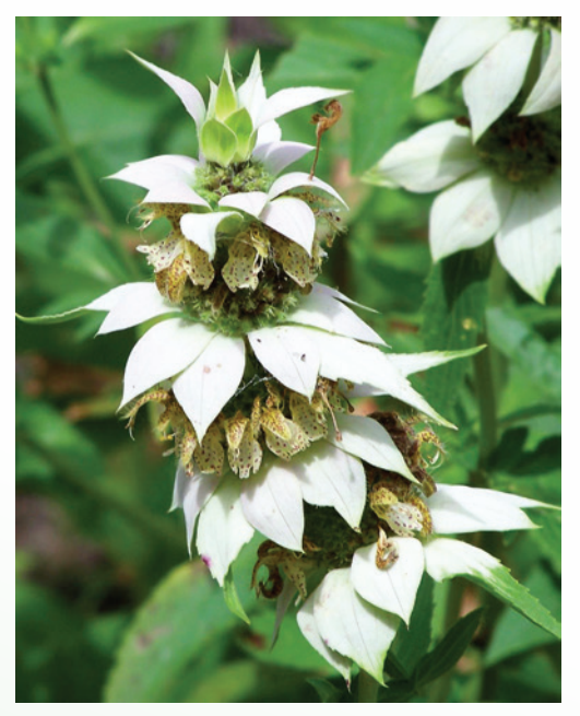
Monarda punctata, spotted horsemint, attracts beneficial bugs.