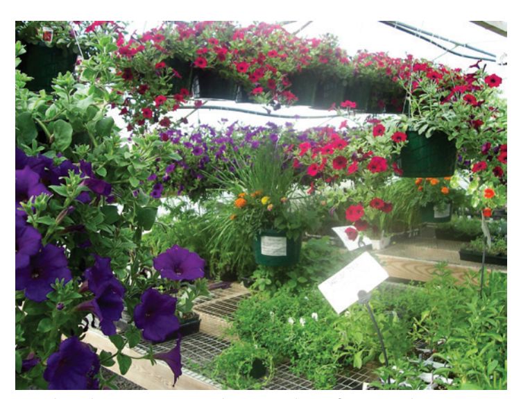
Guardian plants support greenhouse IPM by performing indicator, trap, banker, and habitat functions.

coworkers and customers. Several farm operators have transitioned from a pesticide-based approach to an IPM approach, incorporating biological control as a primary tool for dealing with pests.