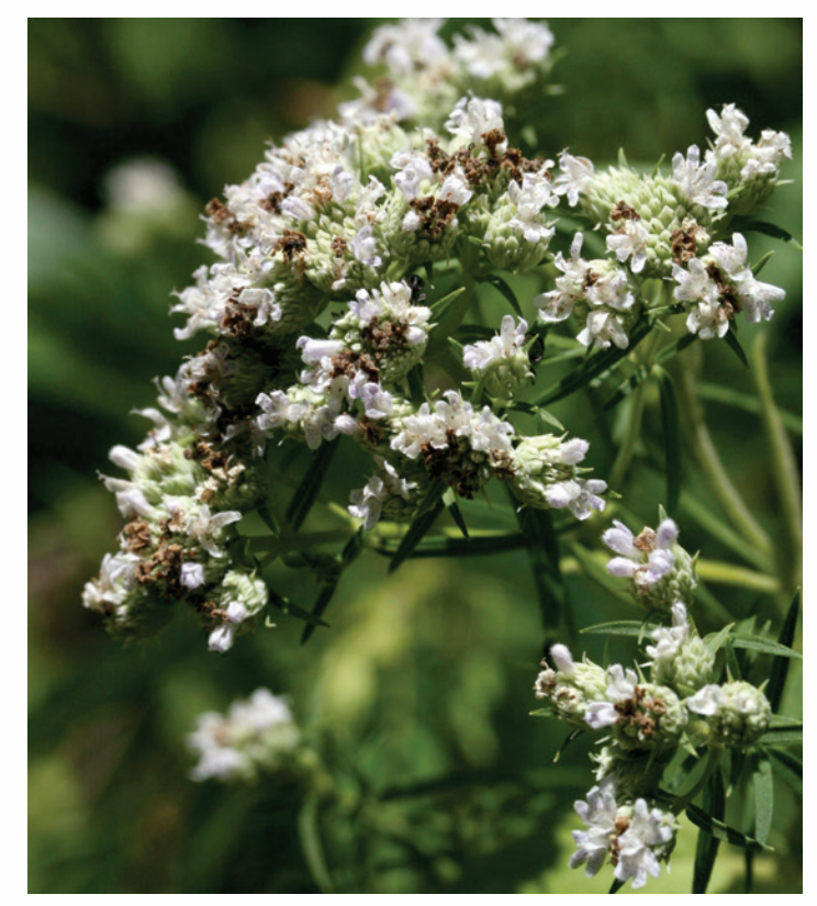
Pycnanthemum tenuifolium, or mountain mint, provides habitat for predators and parasitoids—the good bugs that keep pests in check.