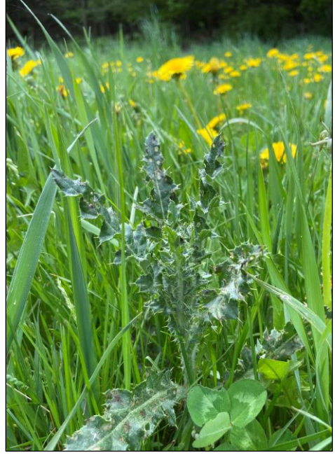
Thistles and dandelions emerge as weeds in hay and forage fields.

This project addresses these needs by providing education, promoting IPM, and fostering stakeholder understanding.