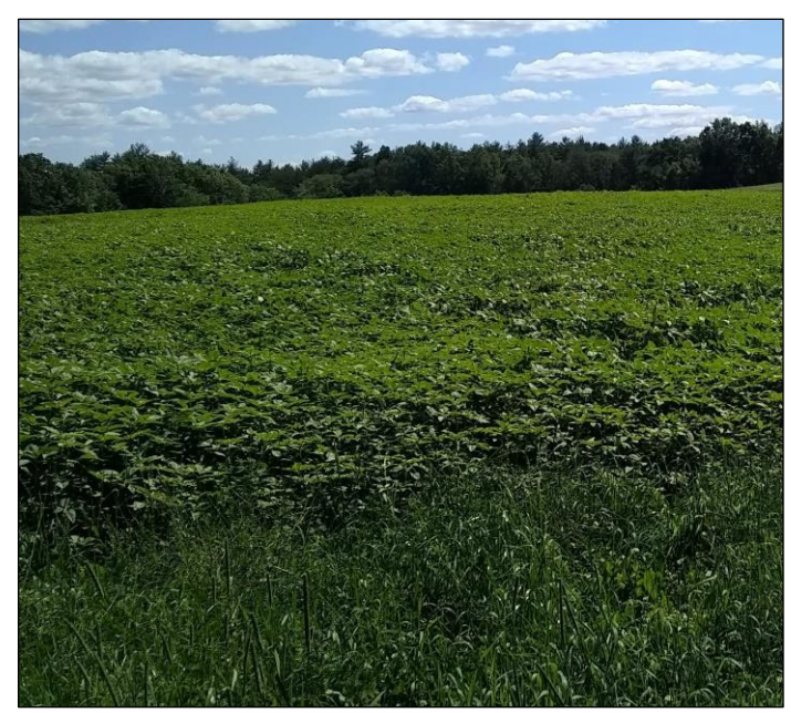
A near monoculture of Redroot pigweed* (background) emerging after a spring tillage event in a pasture. Pigweed seeds had lain dormant in the weed seed bank for at least 10 years without posing any issues for the pasture, likely deposited into the soil during the last rotation of annual crops through the plot.