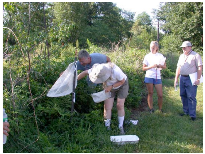
Massachusetts Workshop: The group gets a look at the contents of a pheromone trap.