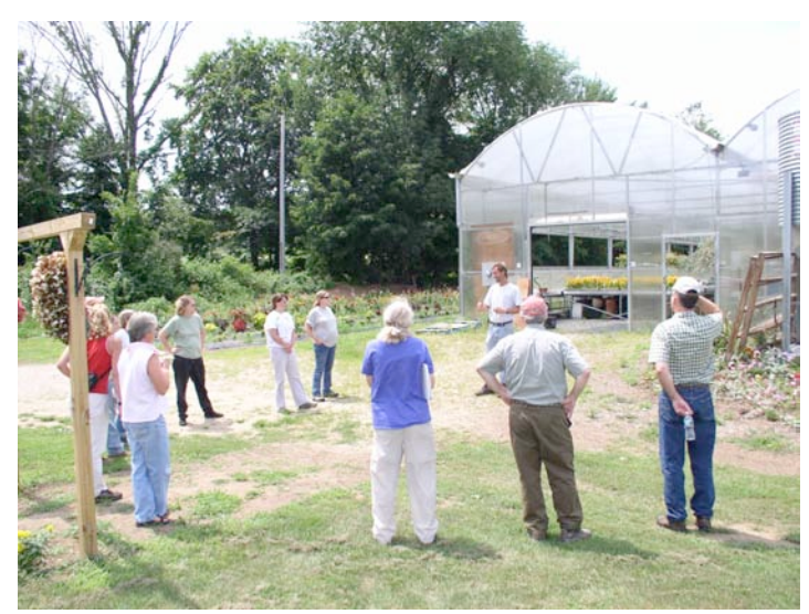
Massachusetts Workshop: Greenhouse at the Kosinski Farm