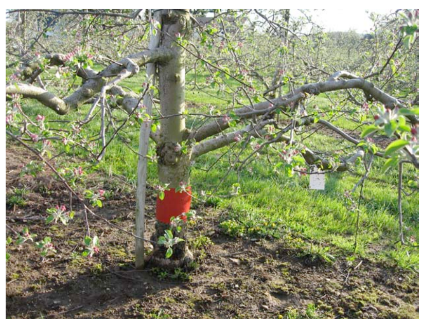
Connecticut workshop: The hanging white sticky trap monitors tarnished plant bug and eastern apple sawfly; the red sticky trap on the trunk monitors apple blotch leafminer.

Connecticut workshop: Lorraine Los speaks fruit IPM training and the use of weather stations for disease forecasting at Holmberg Orchards. This orchard's weather station was purchased through the NRCS EQIP project by us as part of the IPM training.