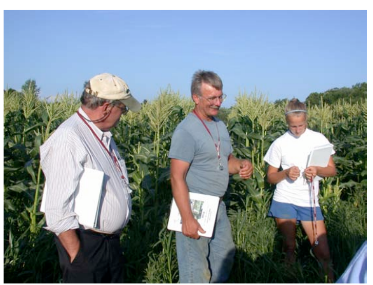
Massachusetts Workshop: Participants learn about scouting sweet corn.