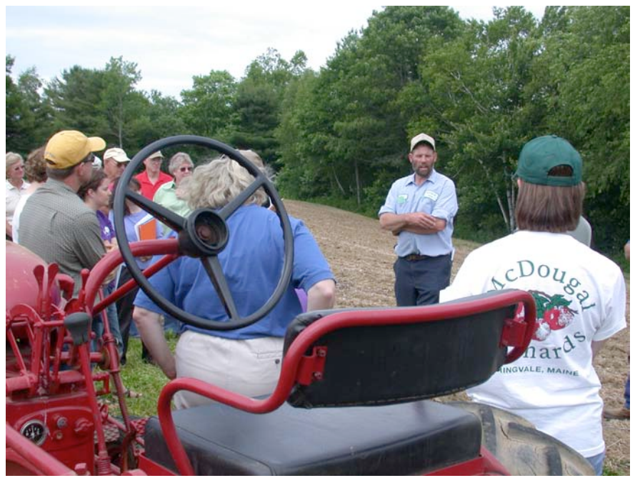
Maine workshop: Nearly 90 people learn about reduced tillage machinery and ways to increase soil tilth.