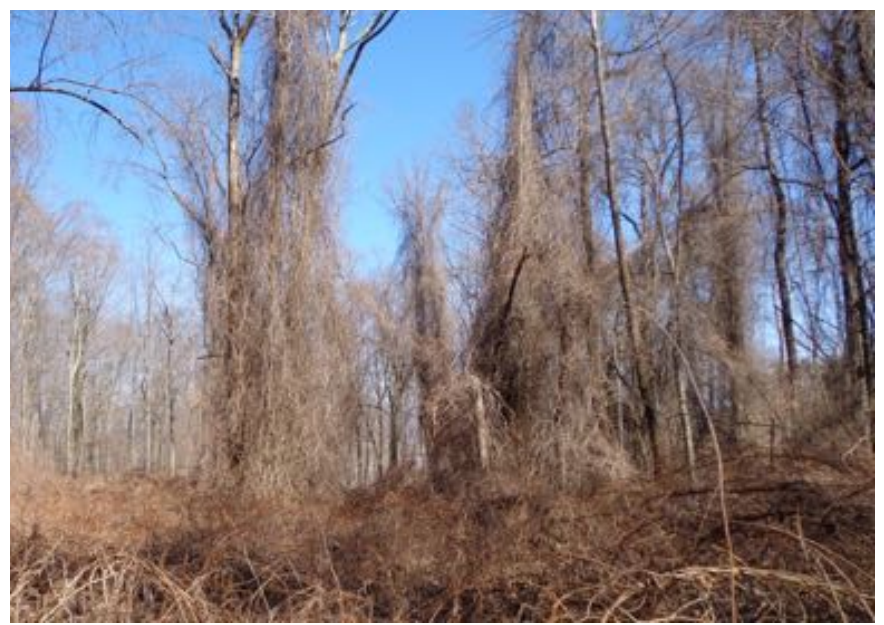
Hardy kiwi vines in autumn after leaf-fall in Burbank Park, Pittsfield, MA.

Representatives from these universities, and from the agricultural community, have claimed hardy kiwi is not harmful to the environment and unlikely to escape cultivation. However, several wild populations that could easily be described as infestations, have been identified in the northeast. At least twenty of these sites are in Berkshire County, Massachusetts alone. Others include Salisbury and Franklin in Connecticut; Brinton Brook Sanctuary, Coffin Woods Preserve, Sterling Forest State Park, and Pound Ridge in New York; and many locations in Morristown National Historical Park in New Jersey.