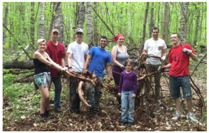
BEAT staff and volunteers removing hardy kiwi vines in Burbank Park in Pittsfield, MA

Since 2012, the Berkshire Environmental Action Team (BEAT) has been focusing our eradication effort on Burbank Park, 188 acres of conserved land in Pittsfield, MA. We are spreading the word about the emerging threat of hardy kiwi and removing vines by hand in the park. While data is still being collected on this species, we hope that it falls low on the Invasion Curve, a tool for describing the status of and informing the management strategies for invasive species. We believe that with swift action a complete eradication at Burbank Park is possible. BEAT encourages property owners and land stewards to use this guide to inspect and monitor their land to identify hardy kiwi populations, report them, and take steps to remove them.