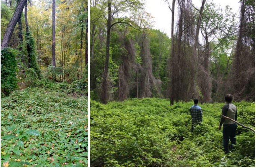
Hardy kiwi - both ground cover and climbing vines.

Root rot is a common problem for commercial hardy kiwi growers in poorly drained soils. However, no significant diseases seem to affect wild hardy kiwi. Frost may be a limiting factor but hardy kiwi tends to live up to its name, generally tolerating temperatures around and sometimes below -22 °F (Micsky, 2013). Insects have not been shown to pose a threat to vines in the wild.