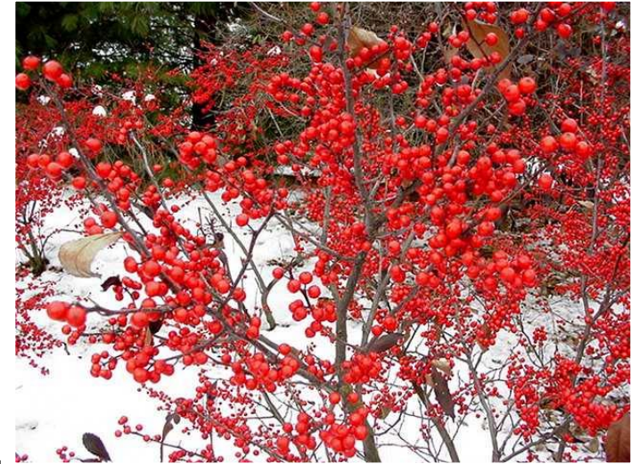
Ilex verticillata , our native winterberry holly, is a magnet for birds and a beautiful addition to your winter landscape

Prevent fertilizer, pesticides, yard debris