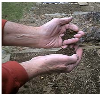
Use compost as a top dressing for your lawn

exotic plants. To protect pollinators, use organic or least-toxic pesticides