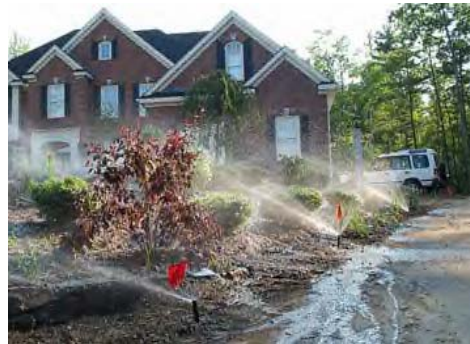
Keep runoff to a minimum by using the one-inch-per-week standard

Water lawns only when needed. One inch per week is plenty in our area.