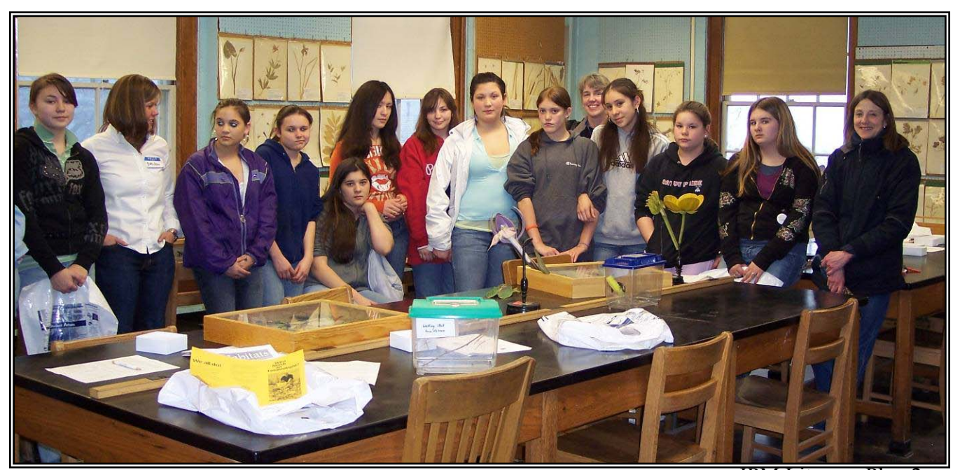
IPM Literacy Plan 2