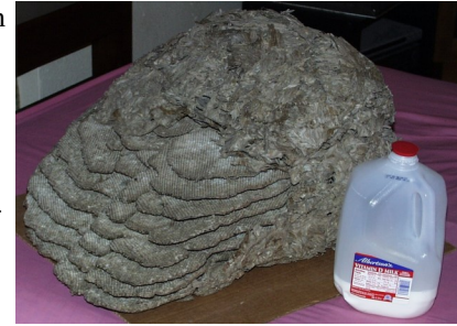
2-year southern yellow jacket nest, Photo: Terry Prouty, Wikipedia commons