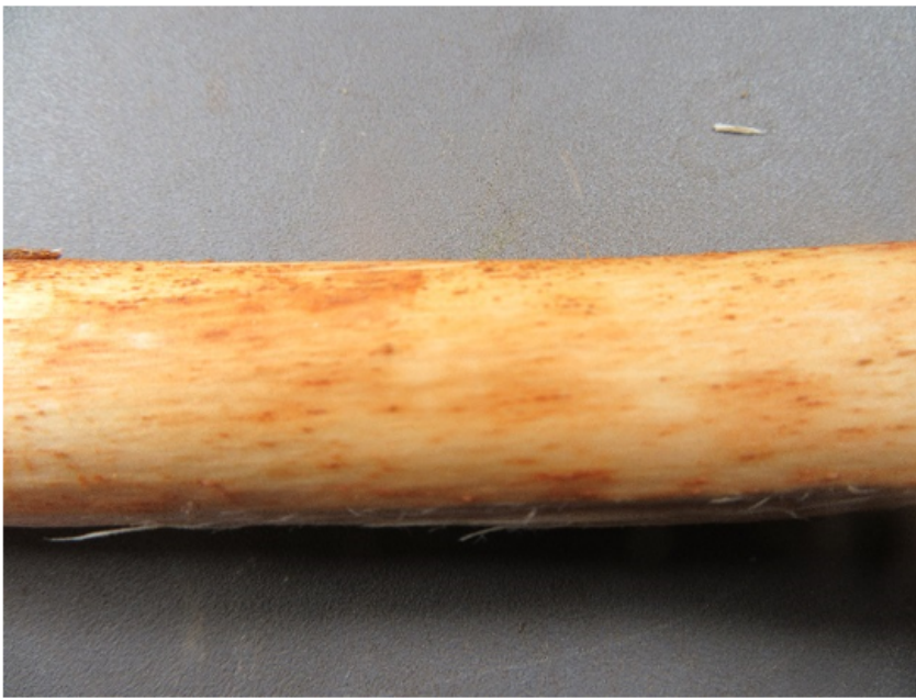
Discoloration indicates phloem damage?