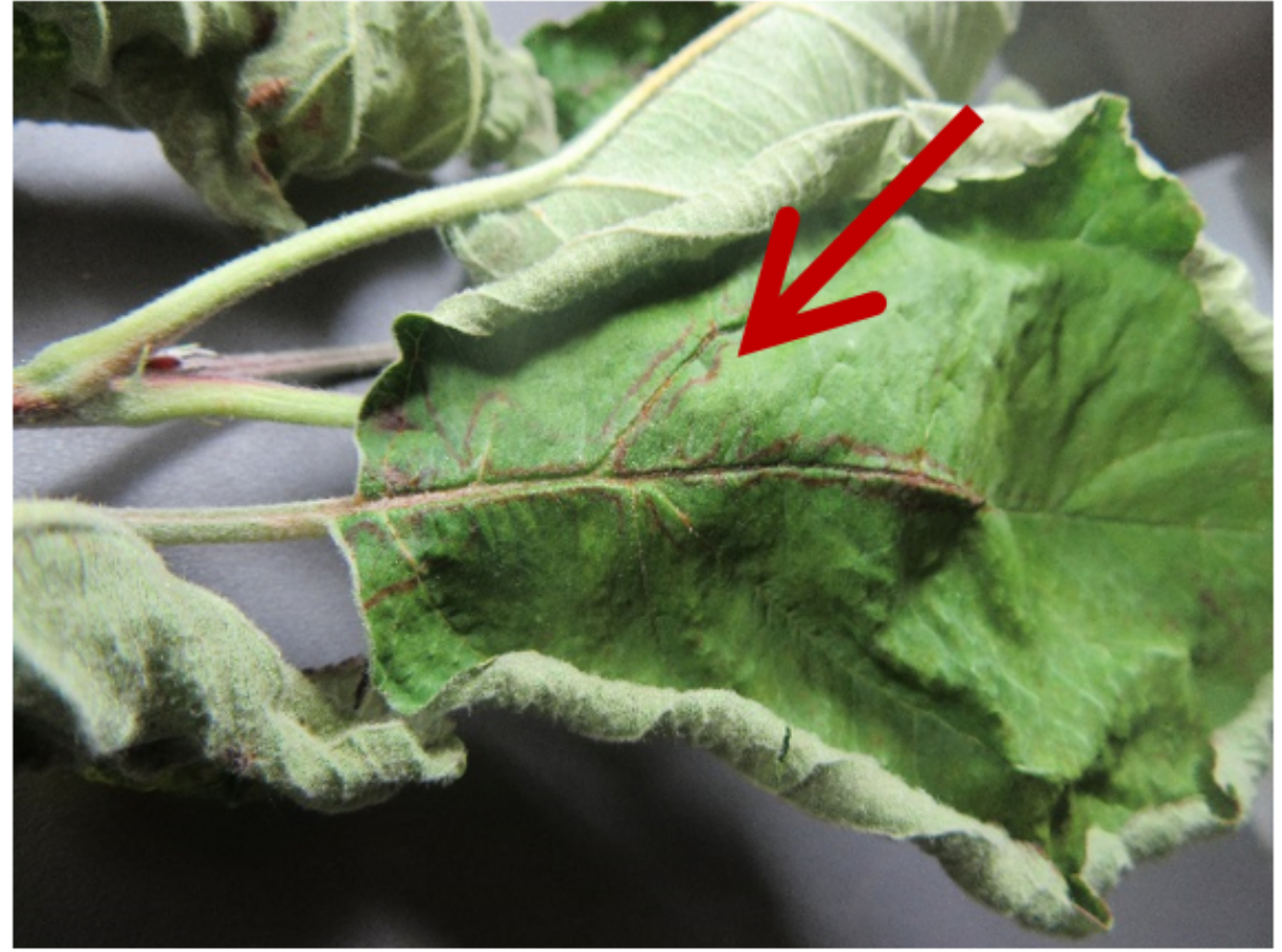
Reddish “progression line” around midrib of less-affected leaves