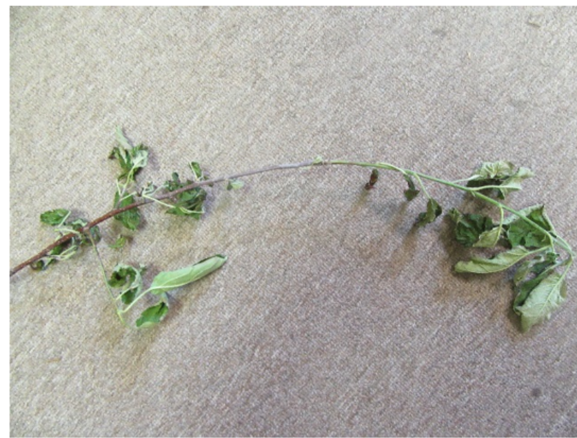
Blank leaf free area on shoot.