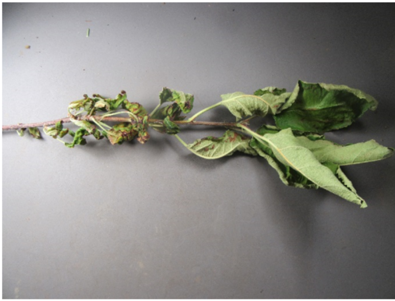
Outer end of shoot leaves less affected