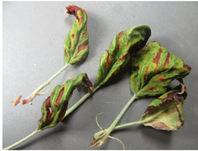
Interveinal, marginal burn, – agent mobile or water loss greater?