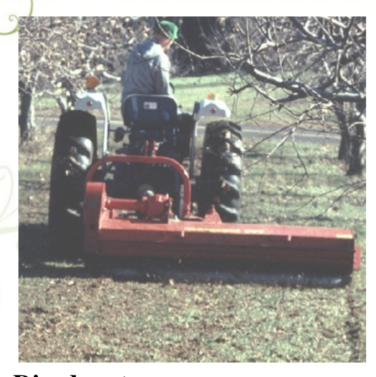
Disadvantages Limited efficacy Can create muddy conditions Reach leaf litter on row