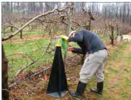
The black pyramid trap, shown here, can be used to monitor brown marmorated stink bug populations. Bugs are attracted by aggregation pheromones at the top of the pyramid.

More than $37 million damage was done to apples in the mid-Atlantic states in 2010. Growers reacted by a four fold increase in pesticide applications. Pesticides disrupted IPM programs and led to secondary outbreaks of mites, aphids, and scales in